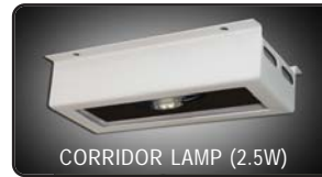
CORRIDOR LAMP (2.5W)